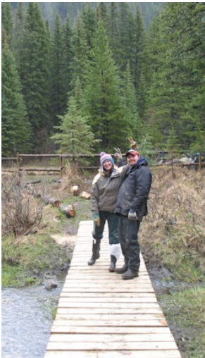
Boardwalk over cold water Sulfur spring at Fall Creek. The boardwalk was built and paid for by volunteers like you!