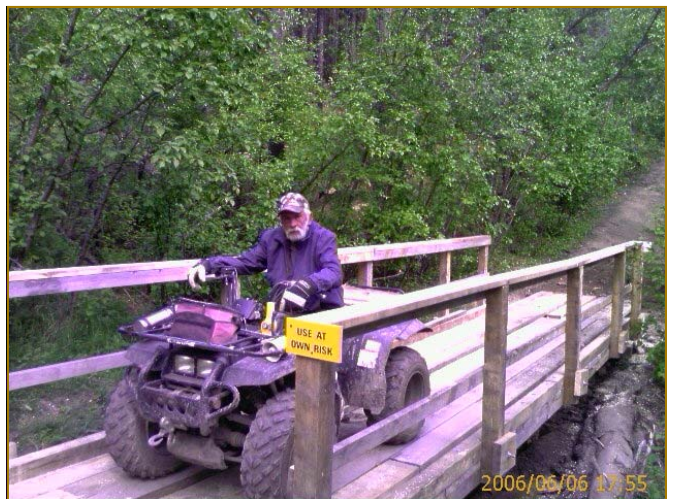
Engineered OHV bridge over crossing #2 on the E7 trail in the Fall Creek area. The bridge was built by Fall Creek Conservation Society Members.

This year the FCCS is install 15 OHV bridges over selected tributaries and large mud holes. Installing the bridges prevents contact between the OHV and the flowing water. This then prevents the mud and dirt on the OHV from getting washed off into the tributary of the Fall Creek and becoming siltation that covers potential spawning beds.